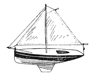
22D40 — Sail Boat. Price each . . . 25¢ Larger sizes 59¢, 98¢, $1.25, $2.25