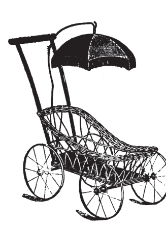
. $3.00, $3.25, $3.75, $4.00